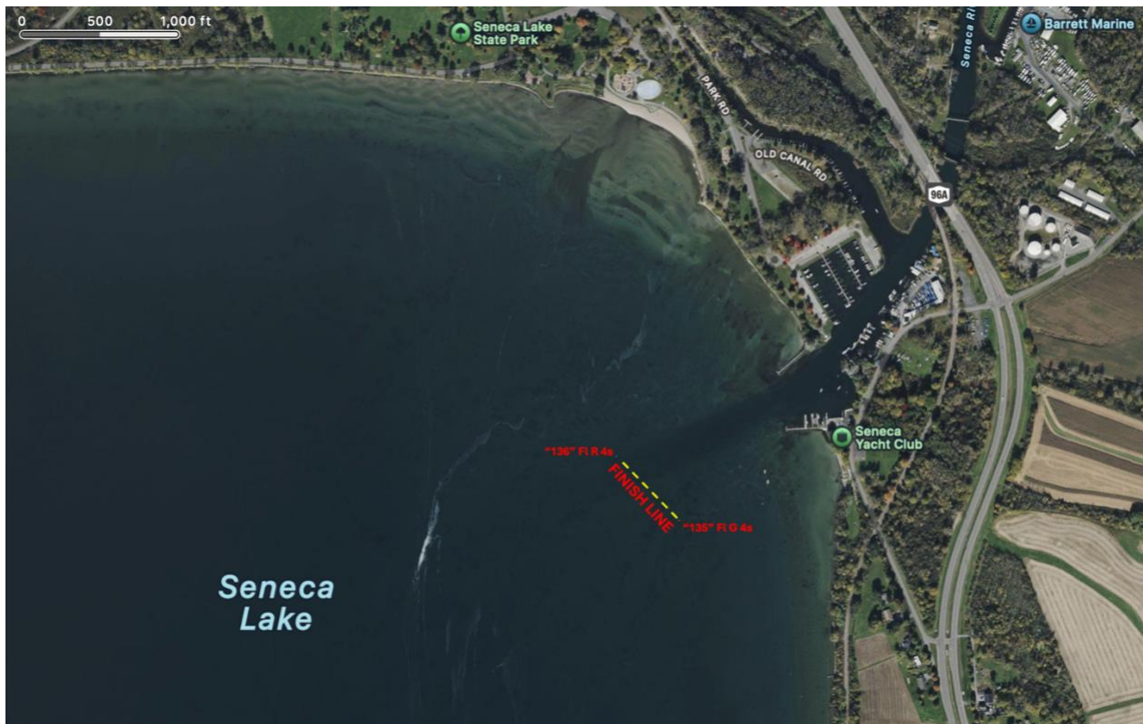
Figure 5: Satellite photo of finish area.