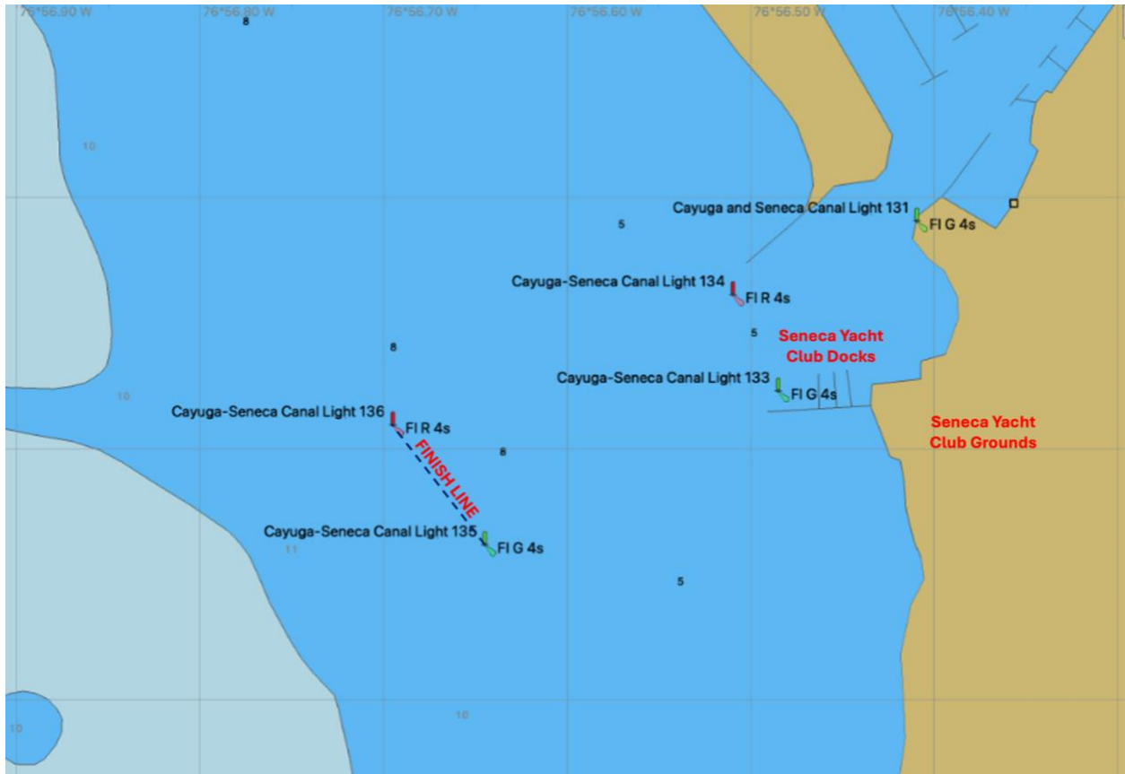
Figure 4; Chart of finishing line at the outer entrance of the Cayuga-Seneca Canal.