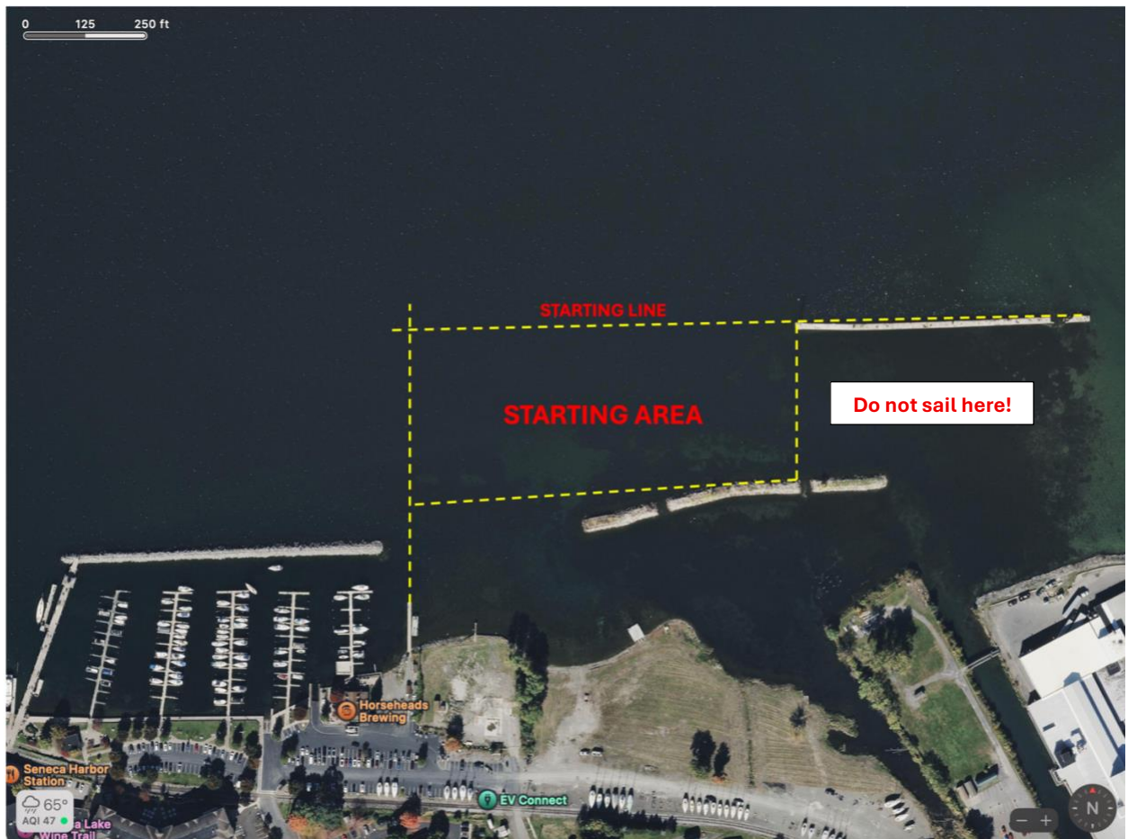
Figure 3: Satellite photo of starting area.