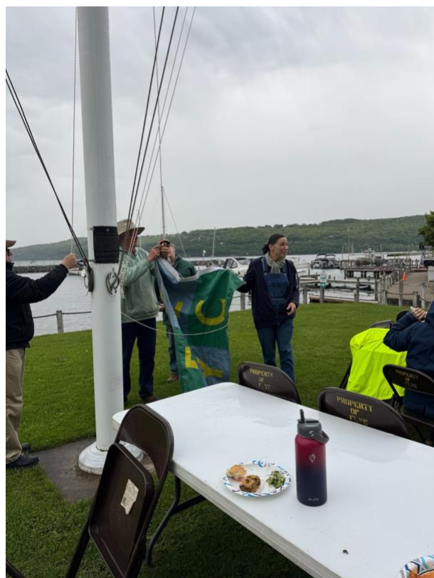
Figure 7: Official FLYC club flag raising.

You can follow Katie and what she's up to on Facebook at "Katie Alley Art" or on Instagram at @katiealleyart.