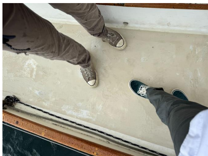
Figure 3: Too much rain and cold to finish painting the decks.

We were all bundled up. I'm certainly hopeful for a warm and sunny June.