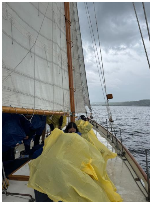
Figure 5: True Love passengers and liquid sunshine.