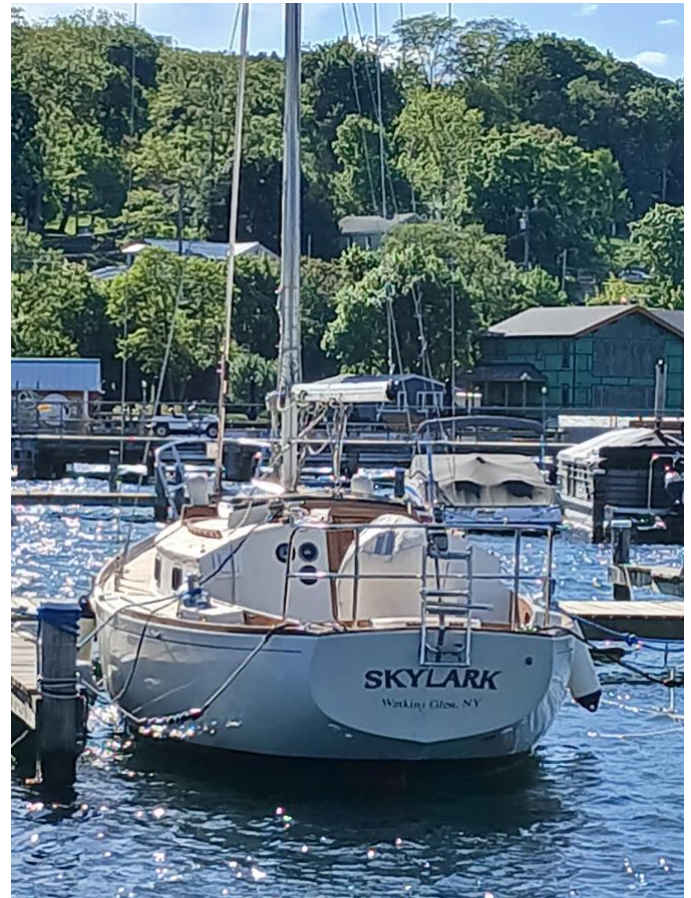
Figure 1: My new ride.

So change is in the offing as I work to get to know Skylark . And as in life and on the race course we often start with one plan but end up having followed a different tack. The wind changes, a sail rips, equipment breaks, or a myriad of events can change the course (literally and figuratively) for both a fleet