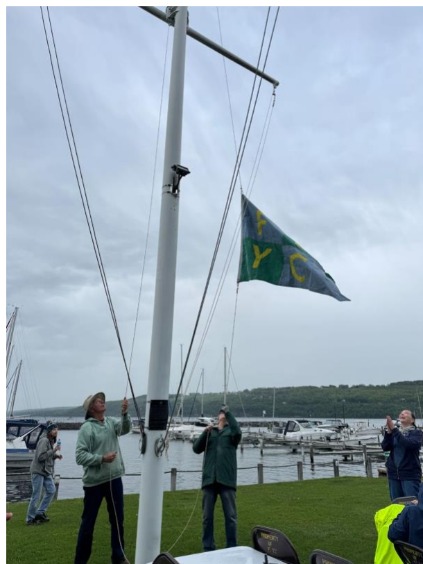
Figure 9: The FLYC 2025 season is officially underway!