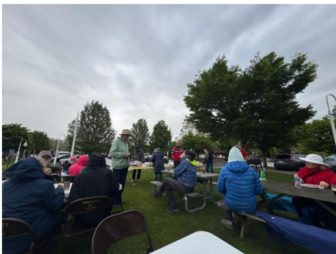
Figure 8: Memorial Day picnic.

I've been staying busy regardless - I'm currently leading an iteration of America's Boating Course on behalf of ABC-FLX for 34 students. It's the largest class we've ever had - proving that boaters certainly put off getting their NYS Boaters Safety Card, despite Brianna's Law being phased in over the last 6 years. (Did you get yours yet?)