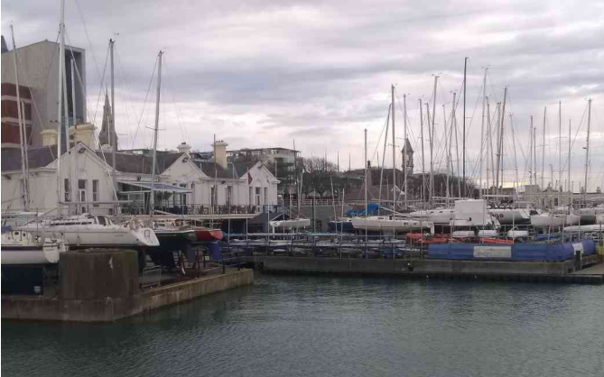
Above: A home in the harbour since 1831; Royal Irish Yacht Club, Ireland.

Being a member of the Royal Irish Yacht Club means being at the heart of a community that has a ‘home in the harbour’. Apart from the core activity of sailing, there are numerous services and benefits available to members and we encourage all to maximize the value of their membership by participating in activities on and off the water. The Club runs a full social programme throughout the year, and members are free to develop new interests within our shore-based activity groups. So whether you prefer the adrenalin of the race start line to learning new dance steps, or simply enjoy the tranquility of the Drawing Room, we believe the Royal Irish Yacht Club offers membership that is commensurate with expectation.