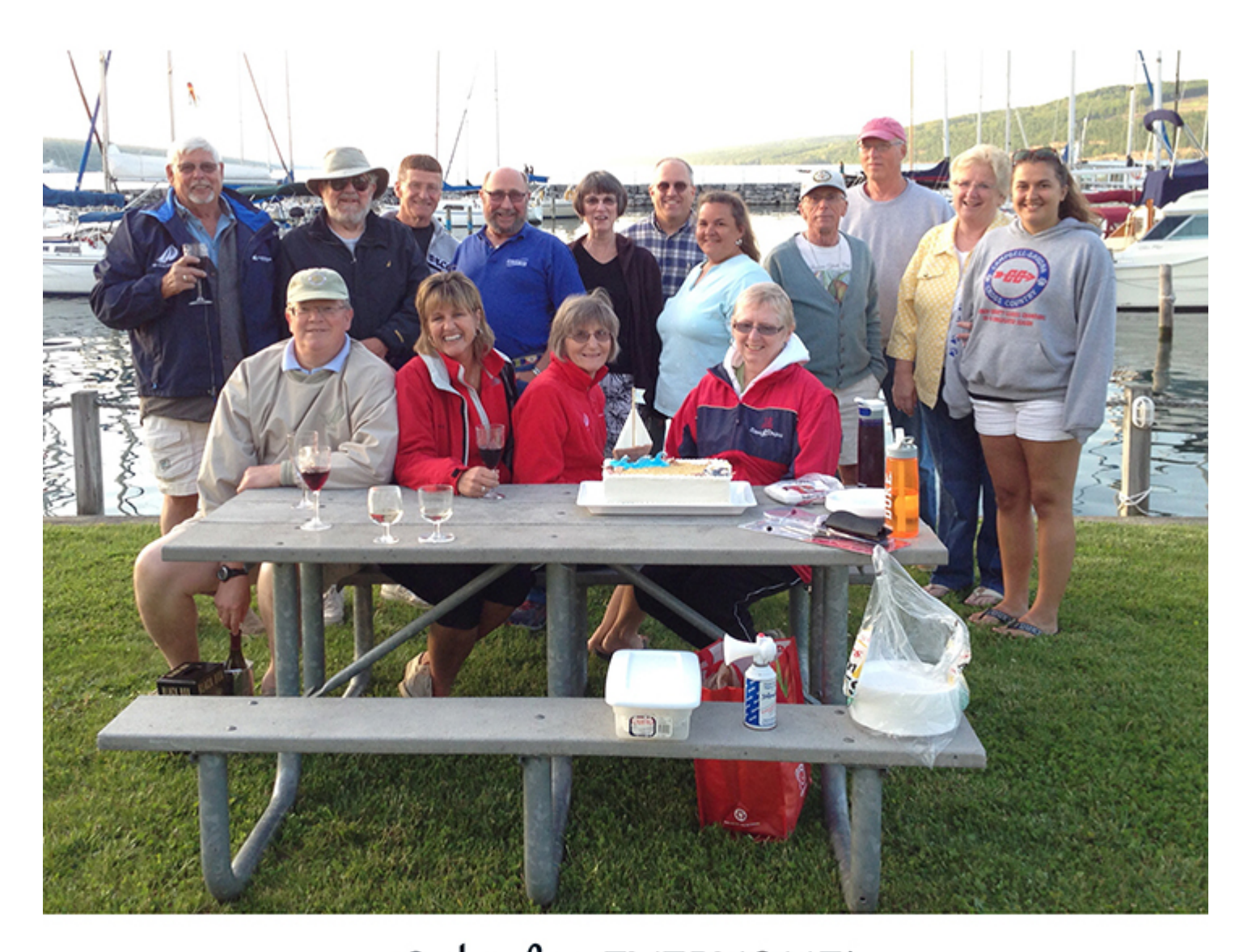
Cake for EVERYONE!

Starting off the sailing season with a Birthday celebration.