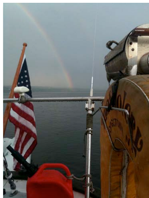
A Seneca Lake rainbow as seen from Tomfoolery after the 2010 Lodi Race thunderstorm.