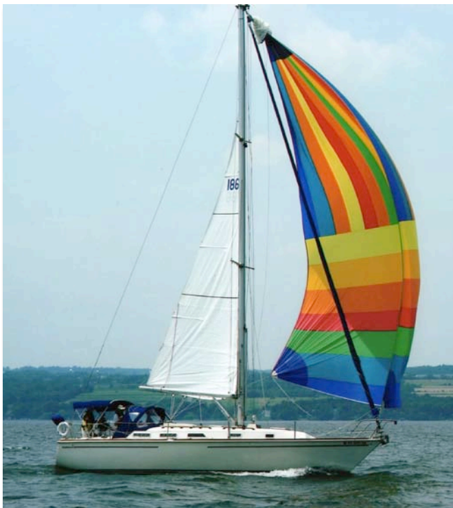
Figure 2 - Amazing Grace at the Lodi Race finish.

Displacement: 16,000 lbs (empty) Ballast: 6,400 lb wing keel Clearance: 52 ft Sail Inventory: Working Main, 130% Genoa, Asymmetric Spinnaker Engine: 35 HP Yanmar Diesel Tankage: 2x50 gal. fresh water; 20 gal. diesel Ground Tackle: 33# Bruce primary w/60 ft 5 / 16 " chain and 200 ft rode; 25# Danforth w/15 ft chain and 200 ft rode.