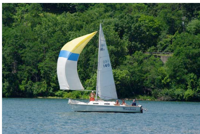
Wanderer flying her spinnaker during Race #2 in 2010.